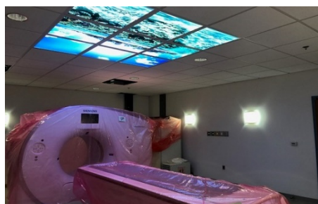
A CT scanner with a view! The landscape portrait on the ceiling helps soothe nervous patients.

Patients coming to the new Hospital Tower from valet/drop-off will enter on Level 1 near Guest Services. Level 1 includes the Anesthesiology Pre-operative Clinic and Radiology.