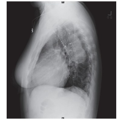
Figure 2. Pre-operative chest X-ray with aortic aneurysm visible posterior to the coarctation repair graft.

This case illustrates the importance of ongoing specialty adult CHD care for surveillance of late complications from childhood repairs. While this patient's residual VSD was known, the degree of left-to-right shunting was underestimated and