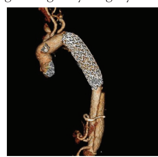
Postoperative 3D volume aortic reconstruction demonstrating complete replacement of the ascending aorta, and transverse arch with individual reimplantation of the great vessels, with the addition of a frozen elephant trunk. The false lumen is obliterated along the length of the stent graft.

Drs. Chen and Leshnower replaced her ascending aorta and entire transverse arch and placed a stent graft in her descending aorta to stabilize the dissection flap, and the patient recovered and was released after only five days in the hospital. Seen recently at her six-month follow-up, she continues to do well, with a healthy baby. Follow-up CT imaging showed her aorta to be quite stable with excellent remodeling. The team foresees an excellent outcome for her.